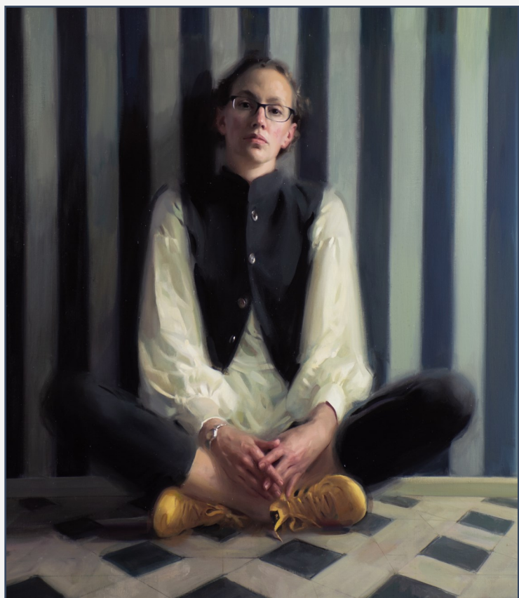
2025 Draper Grand Prize Winner & People's Choice Award