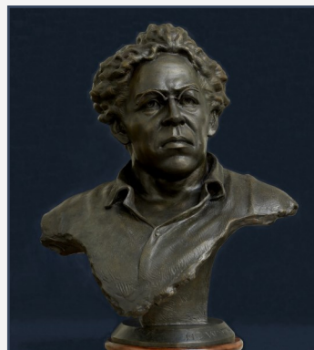
2025 First Place Sculpture Kate Brockman Newell Convers Wyeth 23x14x18", Bronze