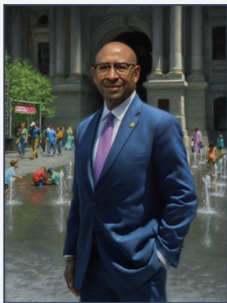
2025 First Place Painting Joseph Daily Mayor Michael A. Nutter, 39x52" , Oil