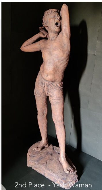
2nd Place - Yash Waman